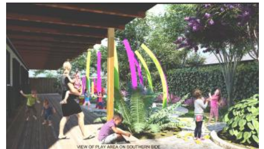
VIEW OF PLAY AREA ON SOUTHERN SIDE