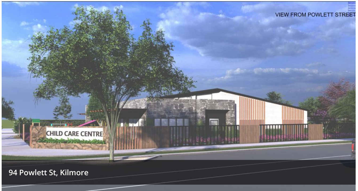
VIEW FROM POWLETT STREET