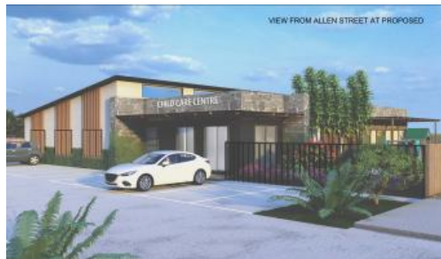
VIEW FROM ALLEN STREET AT PROPOSED